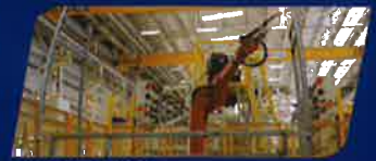
Inverter based Welding