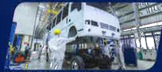
Unique Shell drop concept for Body Building

VE Commercial Vehicles Ltd. puts a new benchmark to the quality of its buses with its new, state-of-the-art bus manufacturing plant in Baggad, around 50 kilometers from Indore, Madhya Pradesh. With an annual production capacity for 15000 buses, the site functions effectively for the production of light, medium and heavy-duty buses. Spread over a huge expanse of 43 acres, this facility is equipped with a high quality robotic paint system, the first of its kind in India. It ensures consistent fit and finish, always maintaining more than 95% gloss and greater than 7 DOI. All the paneling parts are 100% tooled up, ensuring high-level precision at joints. Adhering to the quality commitment, this plant also complies with shower testing technology and GSO safety norms.