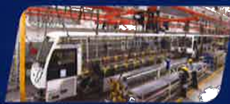
Structure making use of Jigs & Fixtures